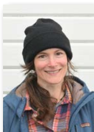
Clare Warner Marine Systems Schooner Creek Boat Works Portland, OR